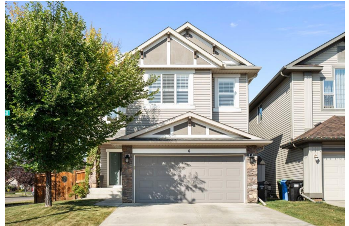
6 Cranwell Square SE, Calgary, AB

Main Floor Exterior Area 1073.48 sq ft Excluded Area 409.94 sq ft