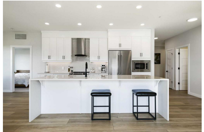
312, 55 WOLF HOLLOW CRESCENT SE REC-MEASUREMENT STANDARD - CALGARY AB MAIN LEVEL (AG) - 1134.96 Sq Ft. / 105.44 m² TOTAL ABOVE GRADE RMS SIZE - 1134.96 Sq Ft. / 105.44 m²

You know that feeling when you are on holidays? When you walk into your high end hotel room and take a big deep breath and then a huge sign of contentment resting your gaze on immaculately maintained and gorgeous surroundings? Then you take a step out to your over sized and spacious balcony to sit down and enjoy the golden hour and wonderful view, all the while thinking...I could live here. Well...here's your chance! Welcome to the Bow360 at Wolf Willow where you are invited to explore almost 1200sqft of luxury living. This stunning CORNER UNIT overlooking the greenspace and park will invite you in and have you feeling like you are in vacation mode immediately upon entering. The 9ft ceilings and spacious foyer opens up to a thoughtfully designed open floor plan that introduces you to TWO BEDROOMS plus DEN complimented with 2 FULL BATHS showcasing stunning black hardware with a professionally designed interior colour palette. Designed by award winning architects S2 you will enjoy the expansive living room with beautiful feature fireplace with floor to ceiling stone and luxury vinyl plank flooring through out the main living and designated dining area which is situated overlooking the deck and greenspace. Corner lot window treatments gives you additional over sized windows that are framed in by custom window treatments and the radiant heating keeps you nice and cozy during the cooler months while the central air vented through out the entire unit