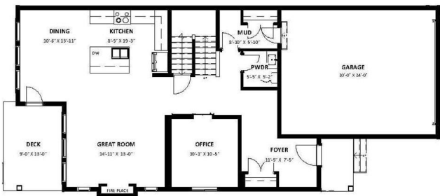
MAIN 1,085 SQ.FT. GARAGE 477 SQ. FT.